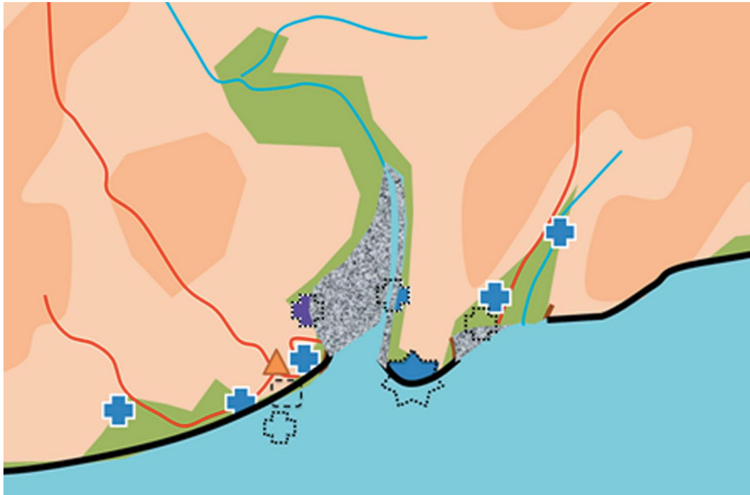
Possible coastal changes at Hastings by 1450 (with dotted outlines of damaged/lost buildings – compare with map above. Severe cliff erosion may have caused loss of St Peters and the market place and two-thirds of the Norman castle on West Hill, also exposing other churches and the Priory to sea damage.

perhaps by the mid-14th century in the wake of the French raids, the Black Death and incessant erosion.