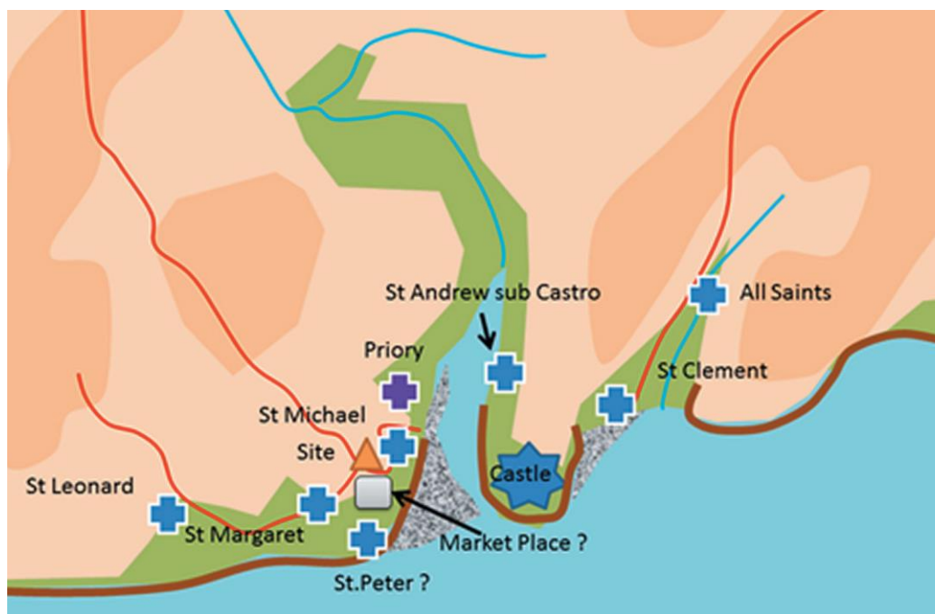
Hastings in 1291 - A township would have enclosed St Michael's, St Margaret's and St Peter's plus a market place (grey square). A site (triangle) mentioned by Gardiner is north of the market. Light buff shows the 25m contour, the darker buff the 70m contour. Thick lines show possible cliff positions in 1291

St Margaret's stood on top of the small cliff behind 50 Eversfield Place behind which its ruins were found and its name is preserved in St Margaret's Road. Its parish was the same as the newer St Mary Magdalene. St Leonard's was in the area of Norman Road, west of London Road, nowhere near the present St Leonard's church. St Leonard was valued at £4.13.4d in 1291 and in 1334 belonged to the Abbey of St Katherine of Rouen. Old St Leonard's graveyard was disturbed when building the former Methodist Church there. The modern St Peter's church is at Bohemia, nowhere near the presumed location of the 1240 St Peter's which has disappeared, the suspicion being that, as its name suggests, it might have been the 'fishermen's and sailors' church, it would have stood nearest the sea, and went over a cliff.